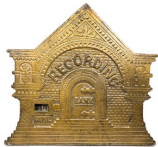
12: The National Recording Bank - Cast Iron