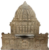
13: Columbia Magic Savings Bank - Iron Bank

Magic Introduction Company. Chicago, IL - 1891. This bank is for dimes and it keeps a record of them for you.